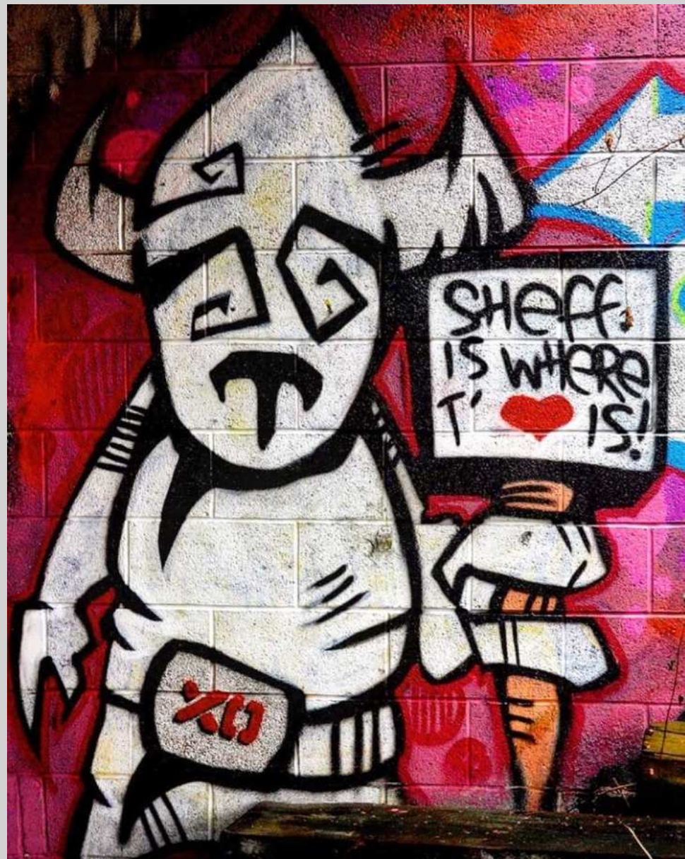
SHEFFIELD - STREET ART 2021