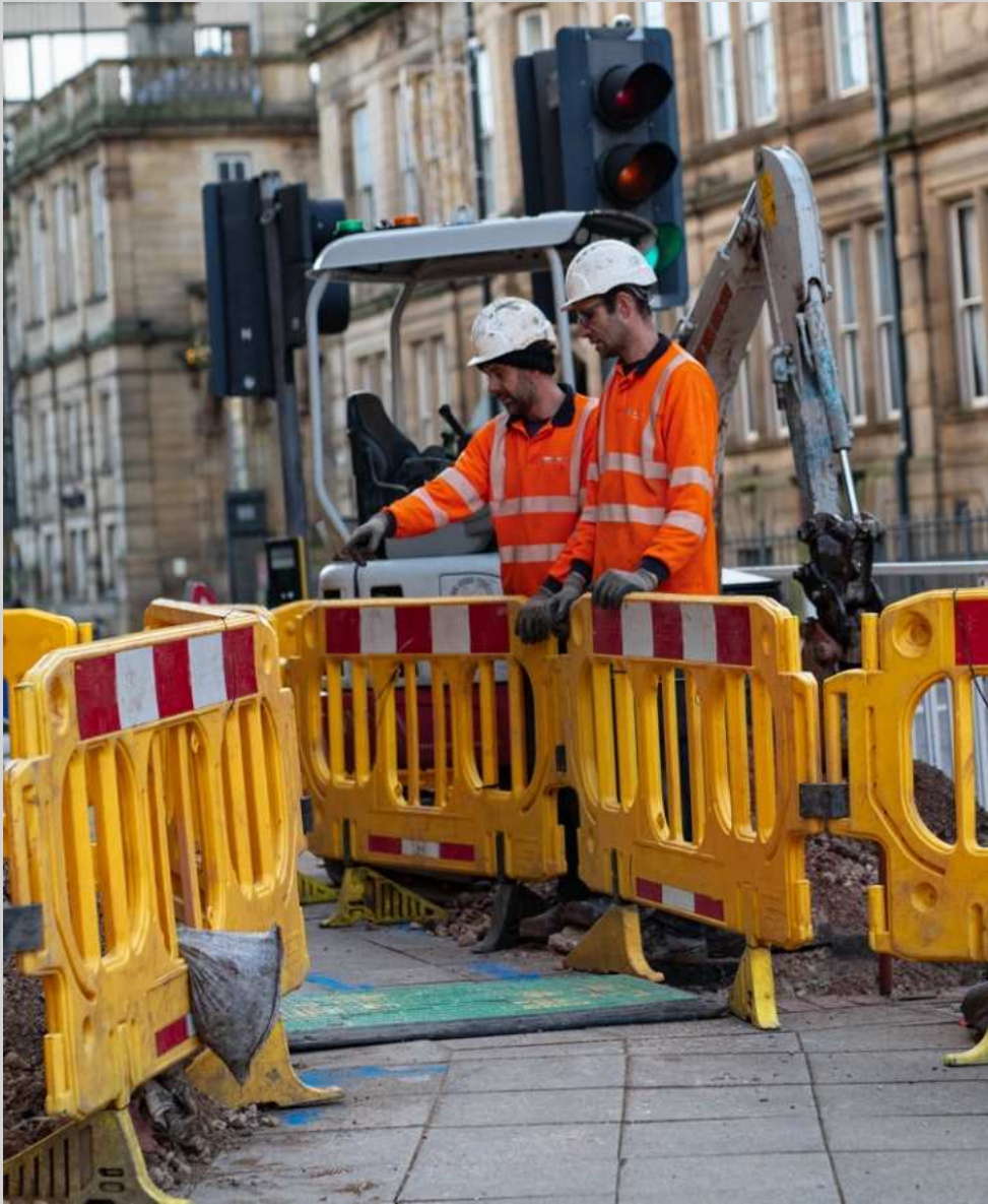
SHEFFIELD - CHANGING FACE 2023