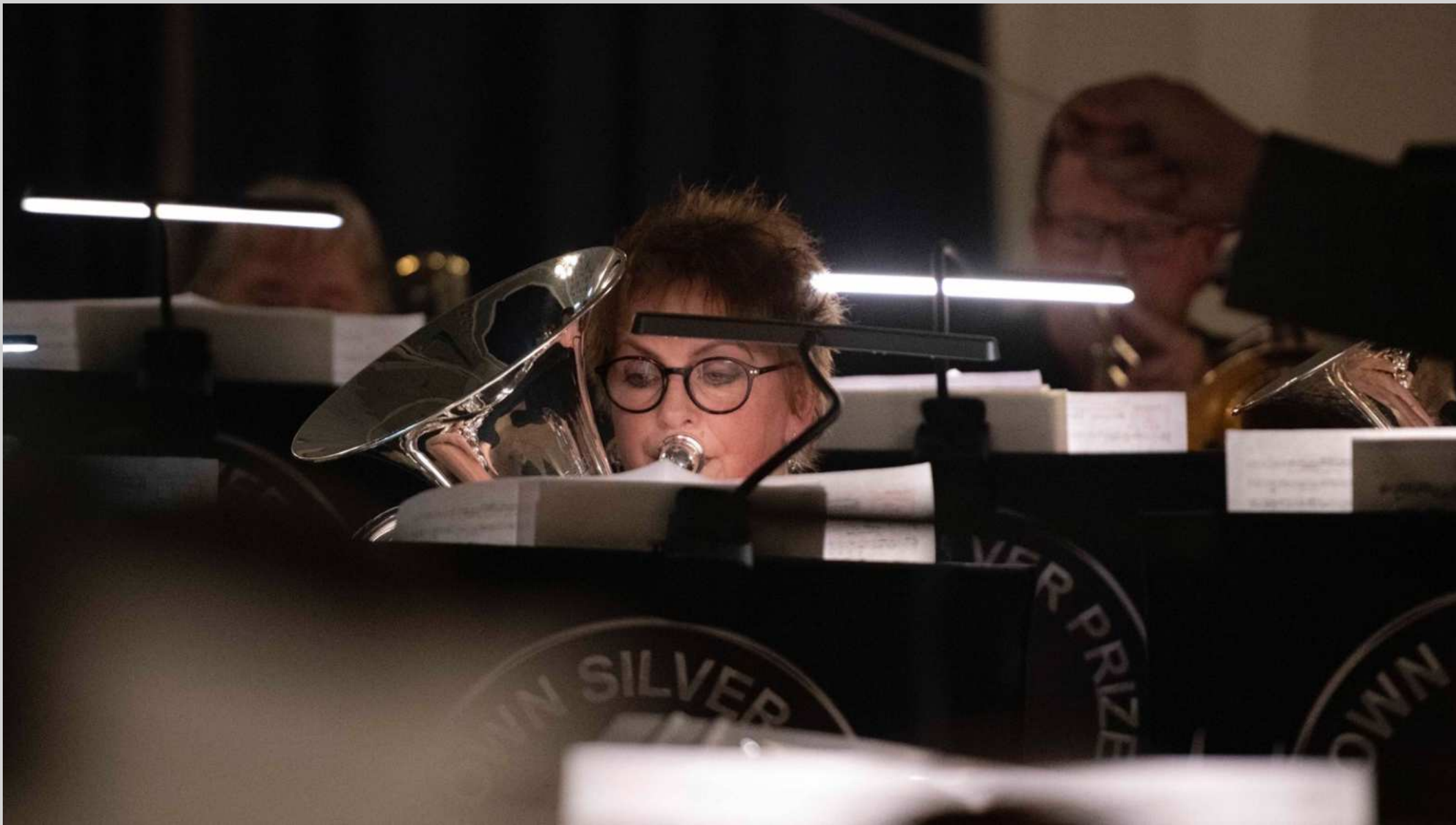
CHAPELTOWN SILVER BAND COMMISSION 2024